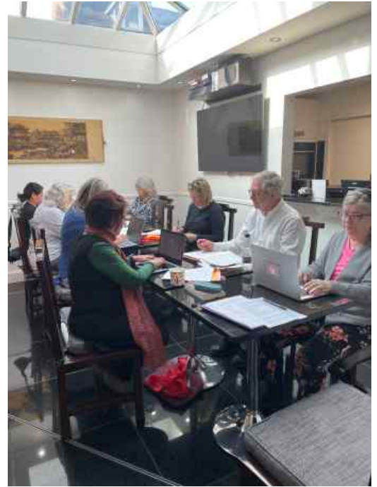
Writing group in York

Throughout the week, we may choose to write in evocative locations around York, and on the final evening, we'll share our work with one another in a final celebration.